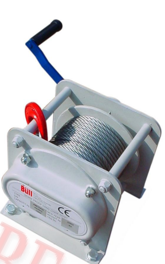
Spark-proof manual "spur gear" winch